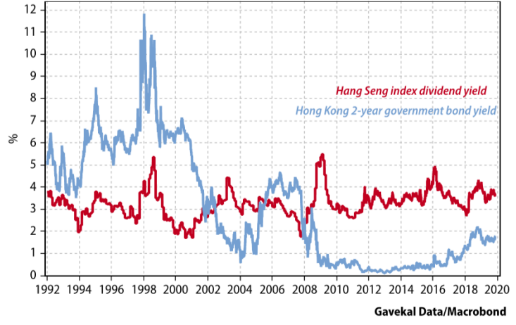
Hong Kong dividend yield & interest rate

An interesting parallel can be found in Australian banks, which at the start of this decade were a favorite short of hedge funds: real estate prices in Australia were falling, the commodity cycle looked to have peaked, leverage ratios were high and the regulator was coming after them. Yet despite these problems, Australian banks offered a high dividend yield, which made them a favorite for retail investors (it also made shorting them expensive). As a result, the trade tended to be disappointing (at least in Australian dollar terms).